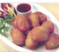
Crispy Chicken Balls