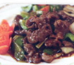
Beef & Black Bean Sauce