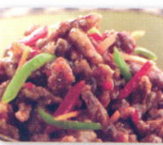
Crispy Shredded Beef